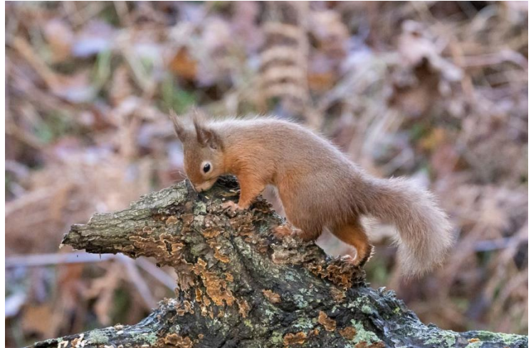
Red Squirrel, Loch Leven Reserve (David Palmar)

After a short walk and again looking at some of the feeders I noticed a photographer who has set up a mini feeding station and then soon picked out a Red Squirrel . I alerted the others and soon we were having jaw dropping views of these amazing and fascinating mammals.