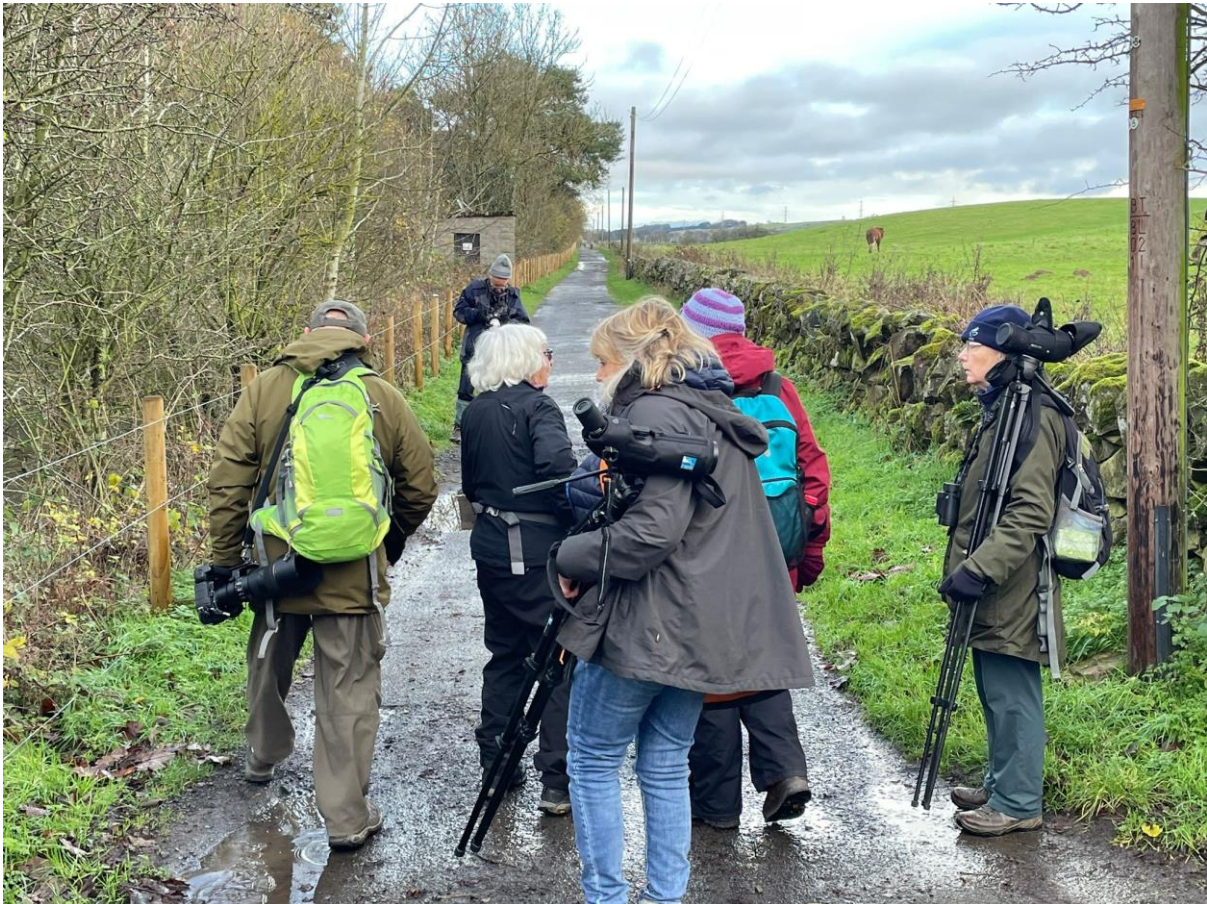
At RSPB Loch Leven Reserve (Donald Wilson)

After we had gathered, we wandered to the main building, and around the small woodland and feeders at the visitor centre we clocked up a good number of common and woodland species including, Tree Sparrow, Treecreeper, Chaffinch , all 4 tit species you would expect, Greenfinch, Dunnock, Blackbird etc.