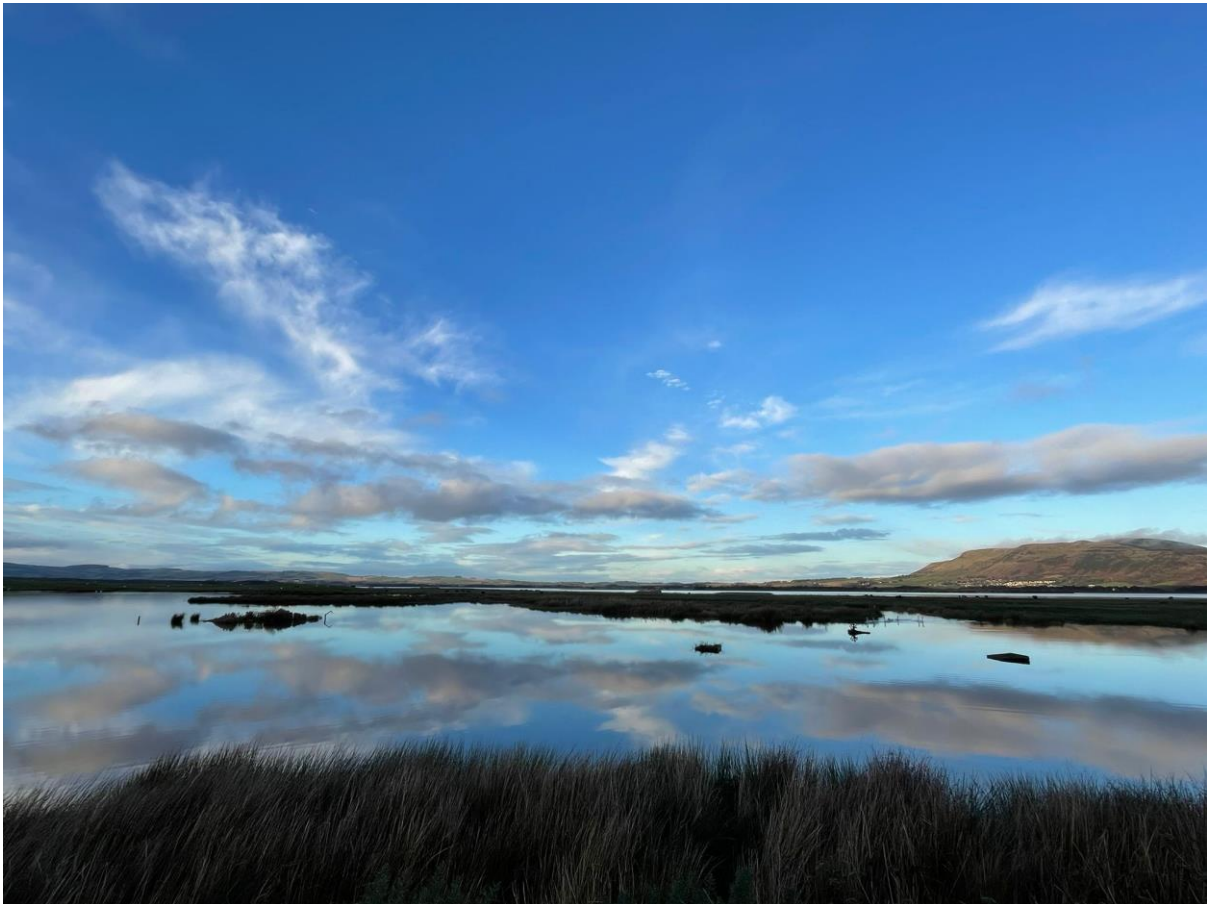
Loch Leven

Including myself, seven of us met at the revamped (and still undergoing renovations) RSPB Loch Leven visitor centre car park.