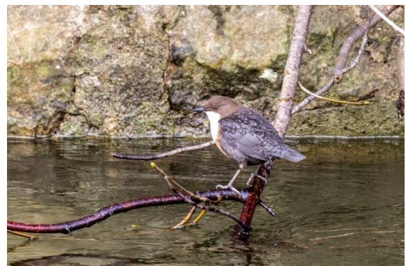
Dipper, Loch Leven Reserve (David Palmer)

Apparently around the sluice and river a Kingfisher was a good possibility but alas we didn't connect. However just on the opposite of the path we all had superb, prolonged views of a Dipper in full breeding plumage which was using some overhanging branches as a perch to dip in and out of the water to feed.