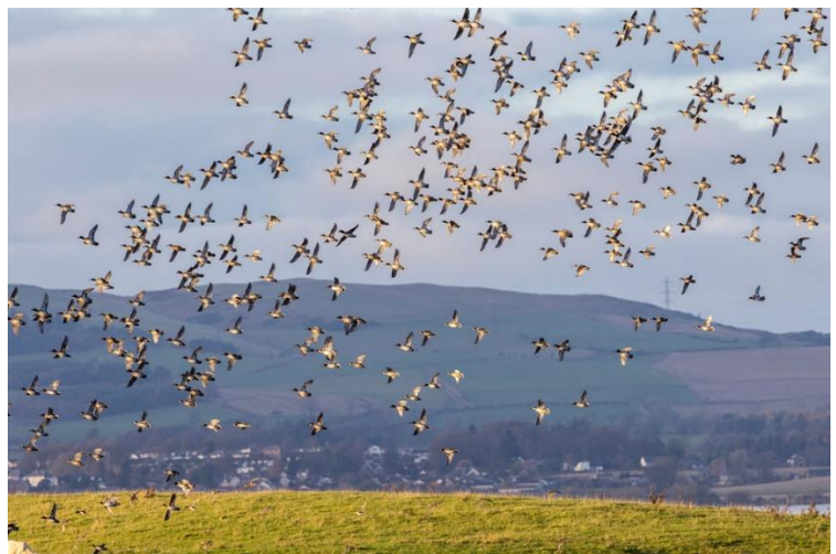
Teal flock in flight, Loch Leven Reserve (David Palmar)