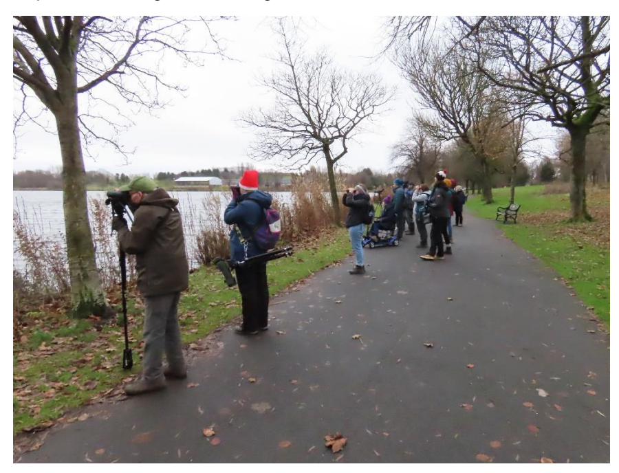
Some of our outing group at Hogganfield Loch

We did see a few Redwing and Fieldfare fly over as well as a couple of Goldfinches but the range and number of birds was a bit disappointing. We continued to the path that runs parallel to Avenue End Road, turned left and reentered the LNR via an attractive stone entrance feature and almost immediately at least 2 Siskin were spotted. A fine male Bullfinch was also seen and photographed by one of the party. This tarmac path led us back down to the lochside path where we turned left and continued to explore the fringes of the wetland before continuing along the loch side path back to the car park discussing the various gulls that could be seen.