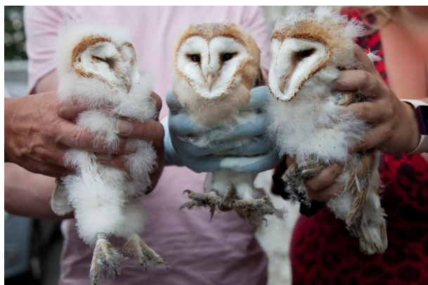
Three young Barn Owls

The scope of the project had originally been to install 12 nest boxes (a mixture of ready-made, bought boxes and those constructed by volunteers), but due to the tremendous efforts of the nest box construction volunteers, and the ongoing demand from people wanting to have boxes put up on their properties, we managed to install an incredible 19 nest boxes - all in Renfrewshire, in areas identified as priority for the species. Boxes have been housed in a variety of locations, including farms and suitable private residences.