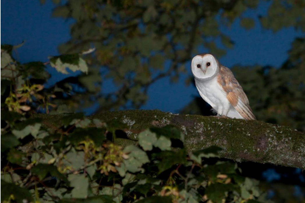
One of the three recently fledged Barn Owls photographed, under licence, in August 2022.