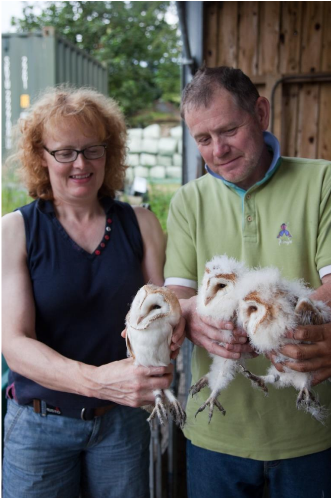
Young Barn Owls being held by their nest box hosts after ringing at one of the project nest boxes sites, August 2022.