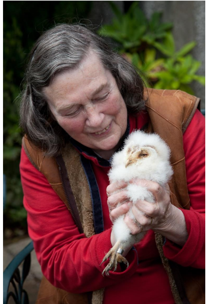
A young Barn Owl being held by one of the box recipients after ringing at one of the project nest boxes sites, August 2022.