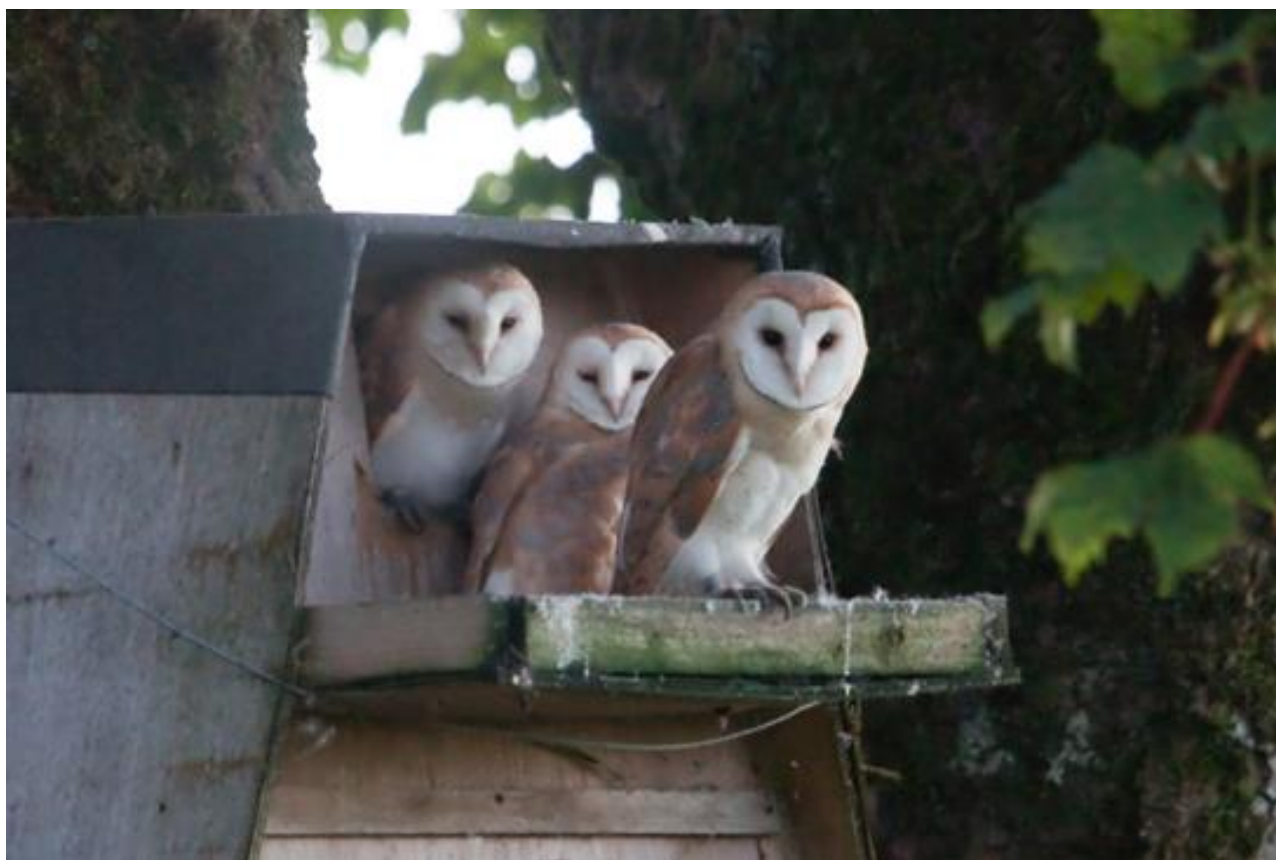
Three young Barn Owls photographed, under licence, at one of the project's nest boxes, August 2022.

During the winter of 2020/21, the Clyde Branch launched our Boxes for Barnies project - a collaborative effort funded by the local group and Garnock Connections Landscape Partnership (supported by a grant from the National Lottery Heritage Fund).