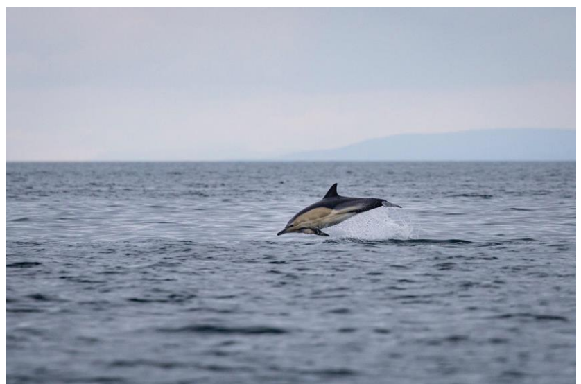
Common Dolphin

As we got close to the Ayrshire mainland the crew showed off a couple of lobsters that they had caught in creels while we were on shore and allowed some of the group to hold them while the rest of us admired their stunning deep blue colourings at close quarters.