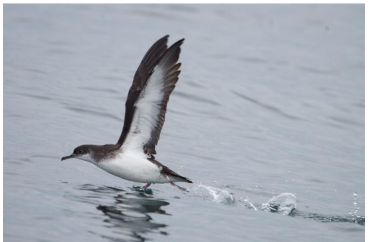
Manx Shearwater