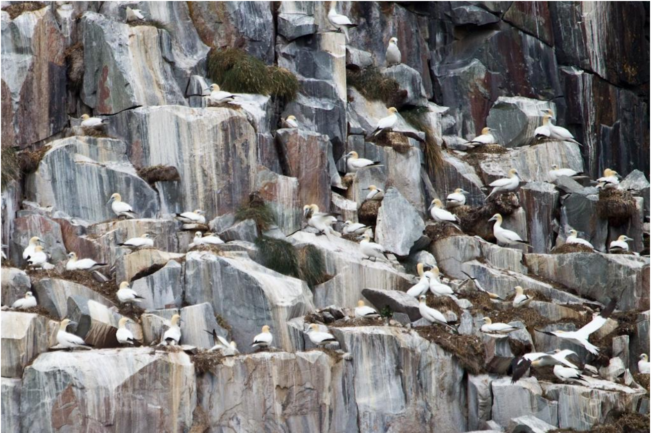
Gannets on the Ailsa Craig cliffs

There were more Shags, with their young, perched on the boulders on the shore and, higher up, the cliff faces were full of Guillemots and a few Razorbills . We saw good numbers of Puffins both on grassy knolls and on the water. It was hard to take it all in. Huge numbers of Gannets breed on the island and we soon saw a stack of a couple of hundred Gannets in the air, close to where several thousand more were on the cliffs. This truly was a sea-bird extravaganza. Something that everyone who is interested in birds should come and witness if they get the chance.