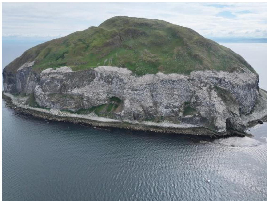
Drone shot of the Ailsa Craig cliffs and Gannet colony

Rabbit Common Dolphin Harbour Porpoise Grey Seal Whale sp. (possibly Minkie)