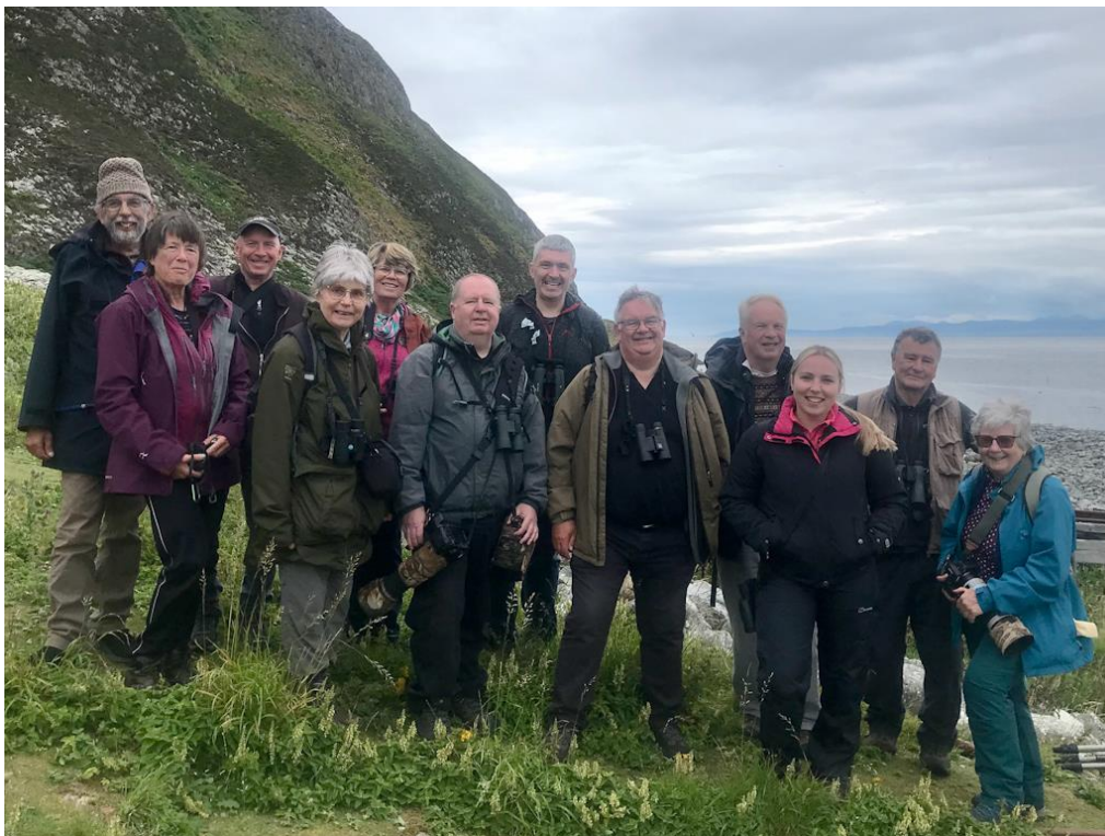
Ailsa Craig Outing group